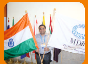
Proudly holding Indian Flag at MDRT meet