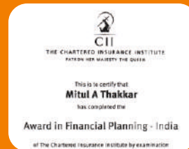
Certified by CII (London)

Insurancevala.com your safety is our priority