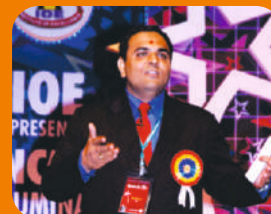
Speaker at International Conventions at Mumbai, Delhi, Hyderabad, Kolkata & in Various Cities