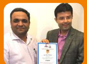
CFP Certified by Chitkara University