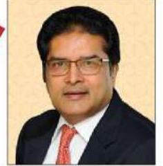
Co-founder of Motilal Oswal Financial Services